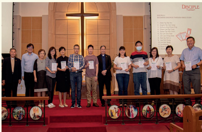
Participants who received their certificates for completing DISCIPLE II

The Following are reflection notes from the facilitators and several of the Disciple II participants.