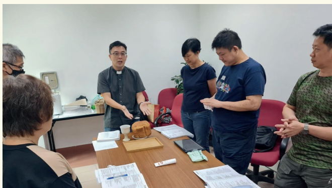
Holy Communion on the last session of Disciple II