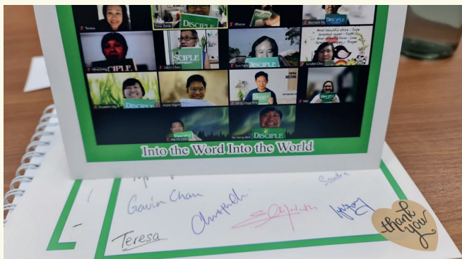
Farewell card for the participants